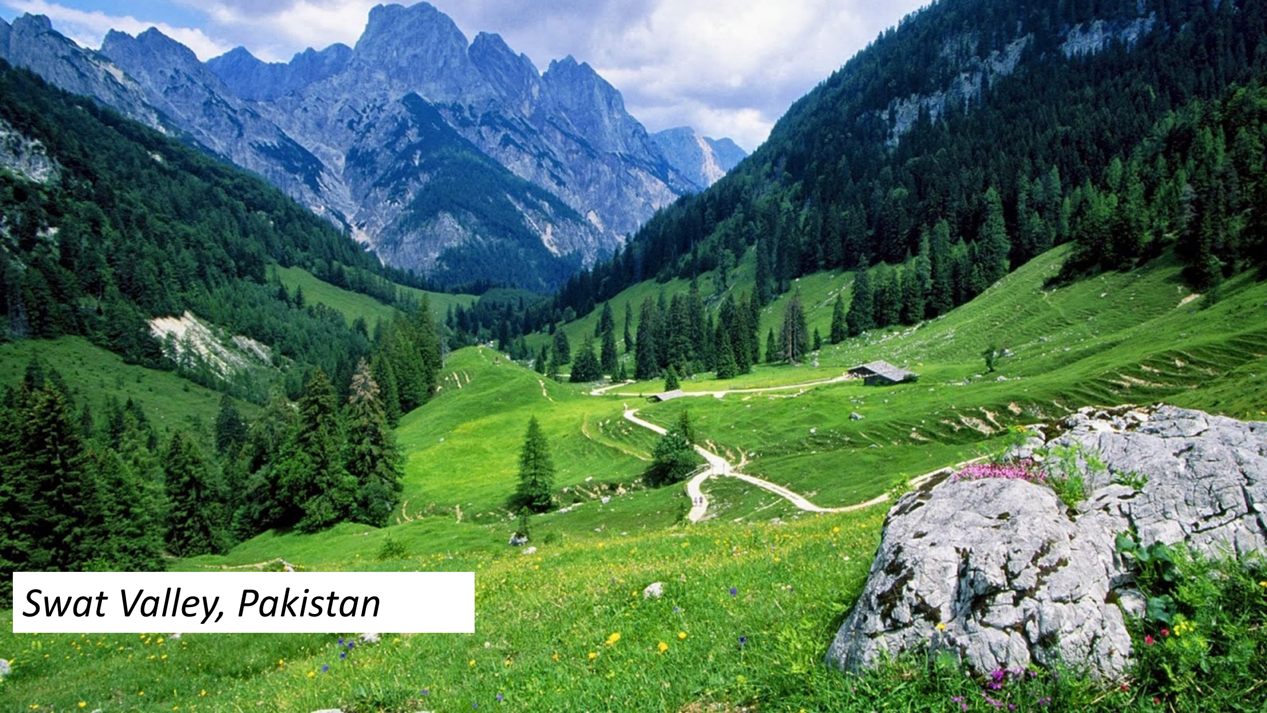
Swat Valley, Pakistan