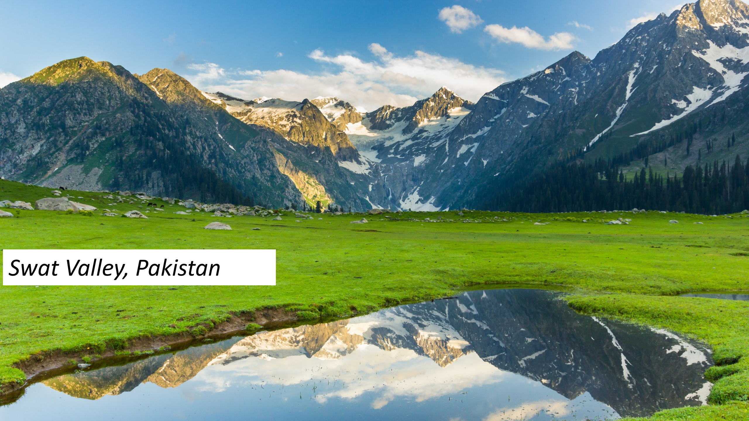
Swat Valley, Pakistan