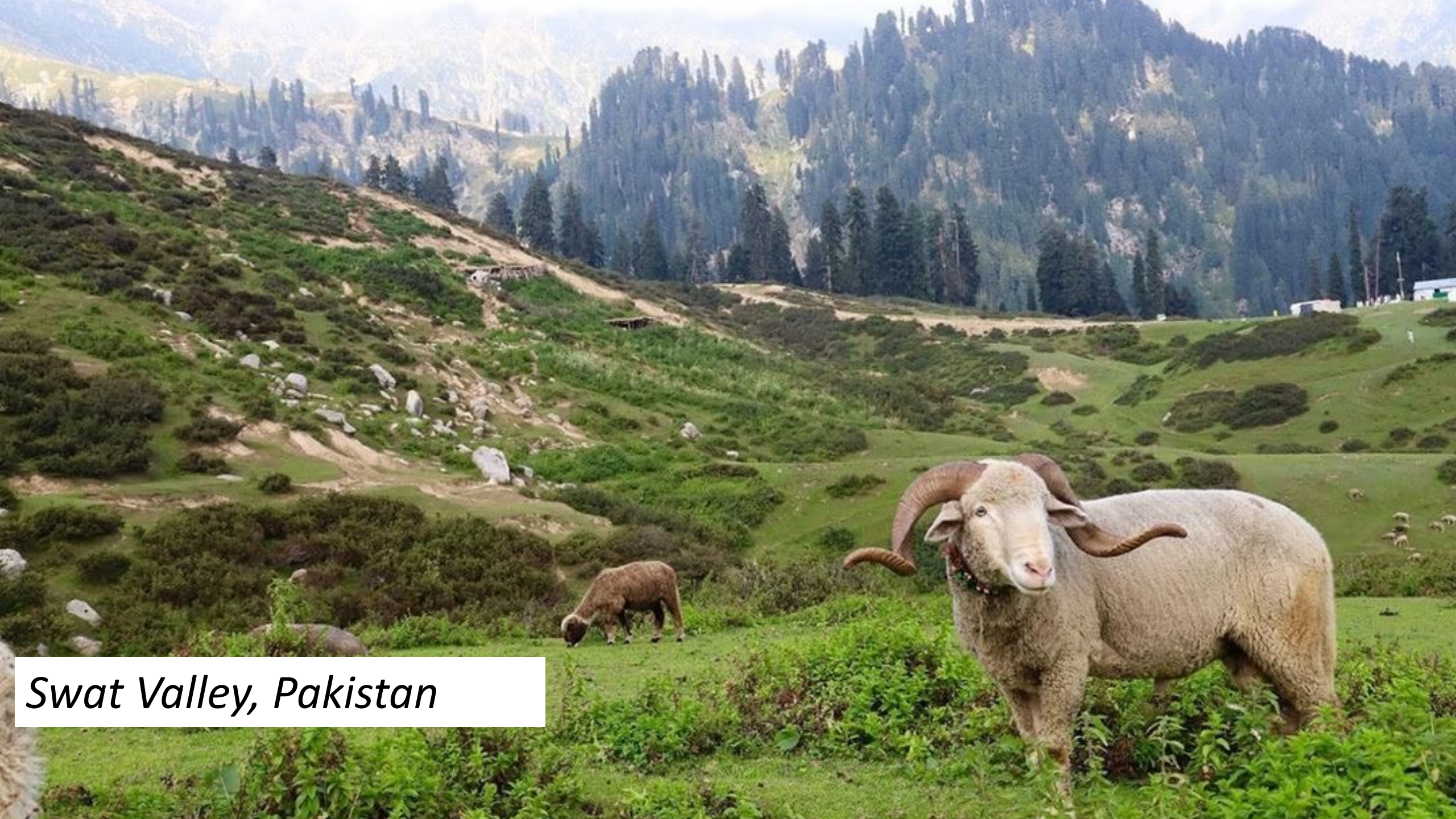
Swat Valley, Pakistan